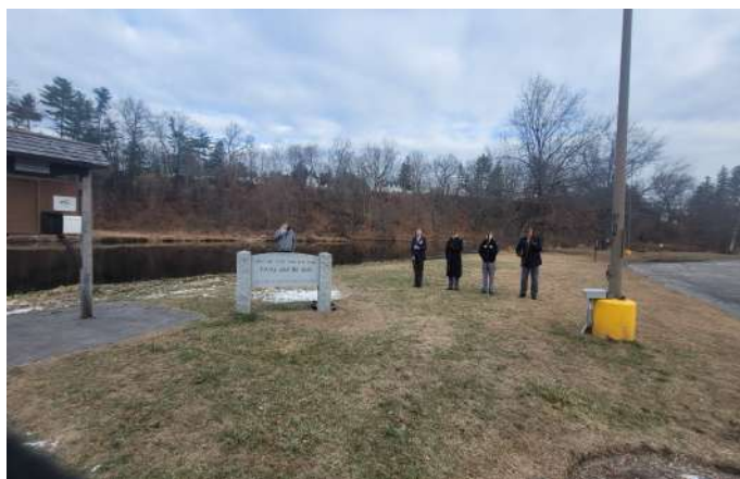
Bugler Bob Guessferd sounds Taps and the firing detail stands at present arms.