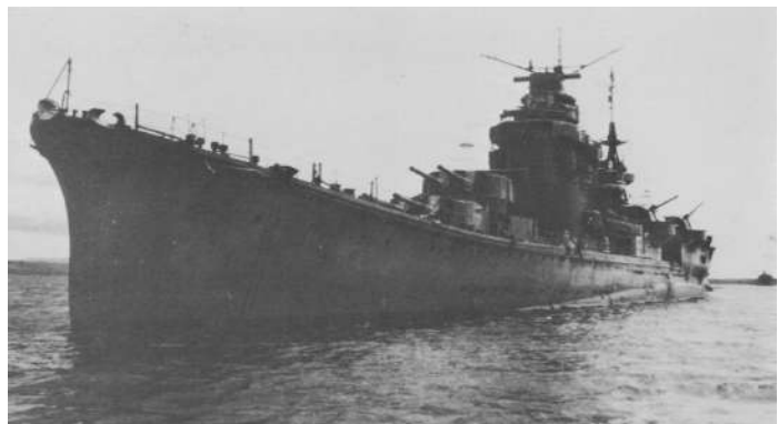
The heavy cruiser Nachi , Admiral Takagi's flagship